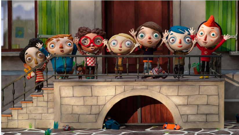
'My Life as a Zucchini' won the first Emile Award for best animated feature film.

In 2D , 3D , Awards , Event , Films , Places , Short Films , Television | ANIMATIONWorld , Headline News | Geographic Region: All , Europe